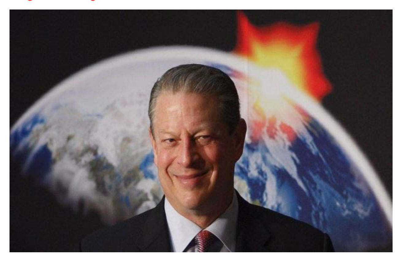
Former U.S. vice president has canceled his event; more than 3,000 Danes have purchased a ticket.

The Holy Spirit in Proverbs said, "The wicked desireth the net of evil men: but the root of the righteous yieldeth fruit," (Prov. 12:12). Again, He said, "A man shall not be established by wickedness: but the root of the righteous shall not be moved," (Prov. 12:3). The Book of Job gives an eternal principle. "Who can bring a clean thing out of an unclean? not one."